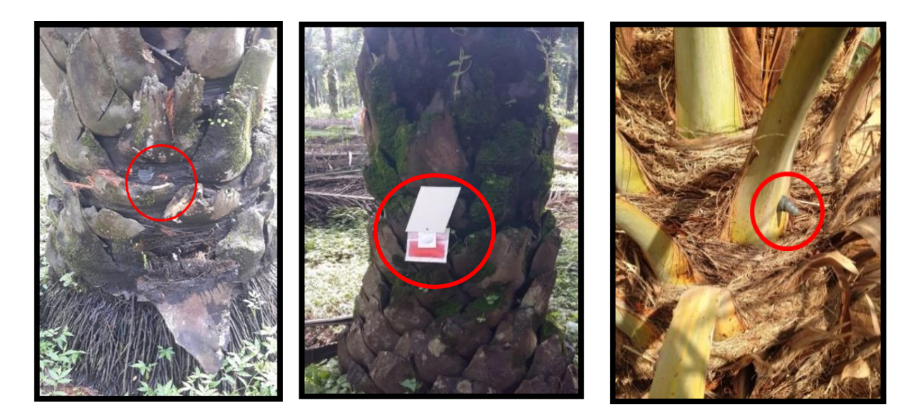
Figure 1. RPW attract and kill systems; Smart Ferrolure paste (left) with a dead weevil and Card device (middle), Hook RPW Dollop (right)