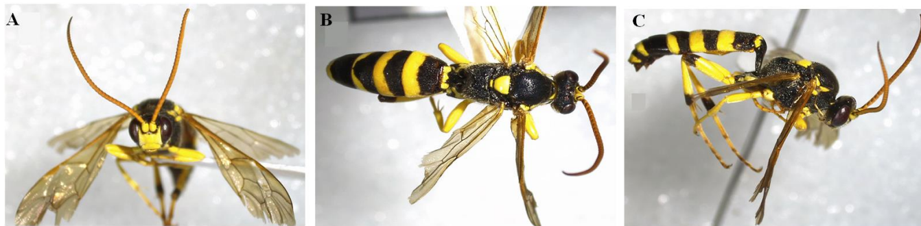
Figure 1. Male of Ichneumon ostentator (Heinrich, 1978): (A) head view, (B) dorsal view, and (C) lateral view.

We want to thank Dr Gavin Broad (Natural History Museum, UK) for confirming the identity of the two species.